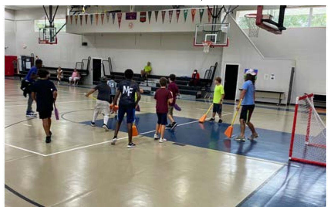
Playing broom hockey in the gym