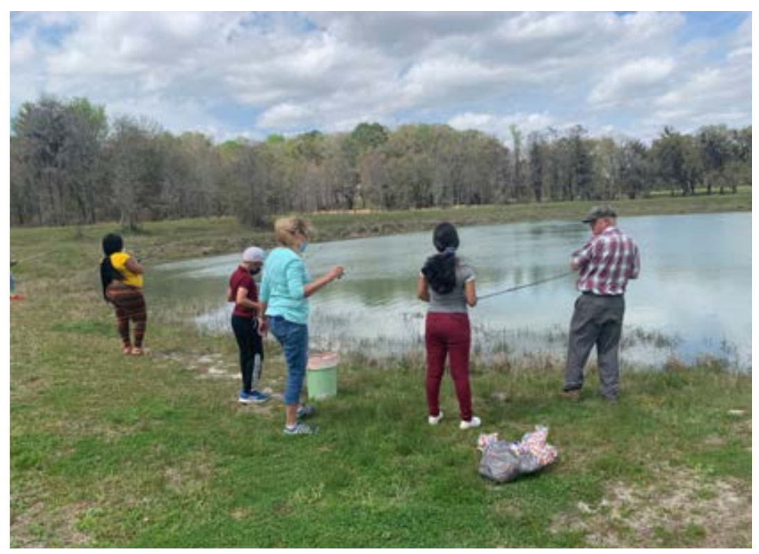
Fishing at our Madison Youth Ranch