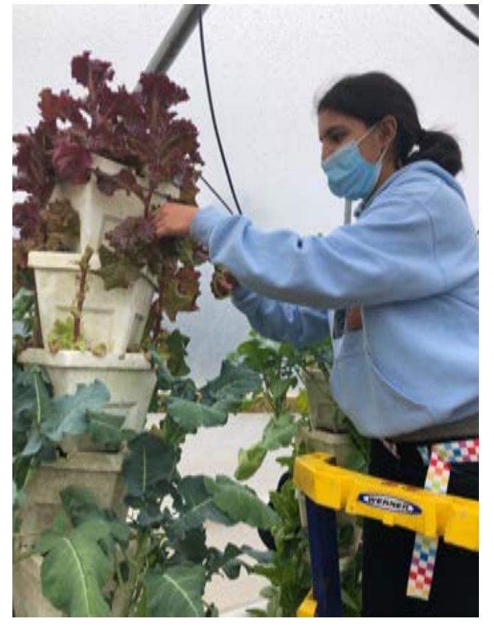
Youth harvesting lettuce in the Madison Youth Ranch greenhouse