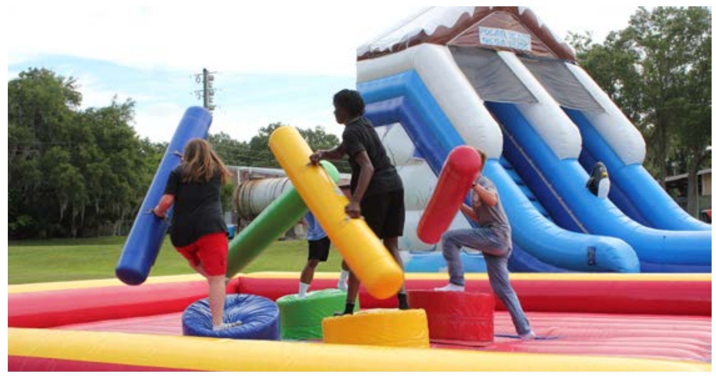
Friendly competition at the End of School Year Party