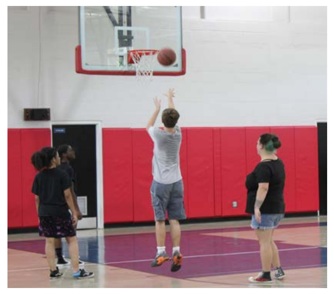
Youth enjoying a pick-up game in the gym