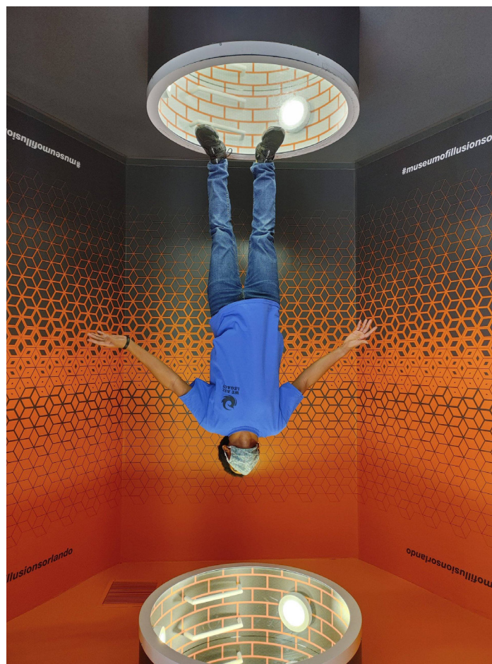
Having fun at the Museum of Illusions