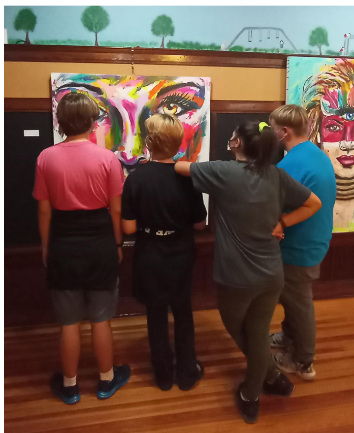
Studying an art exhibit at a local museum