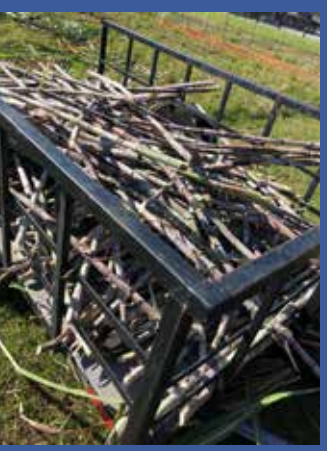
Canes are harvested and transported to the grinder