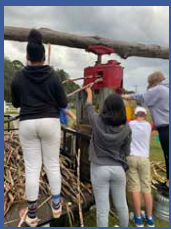
Juice is extracted