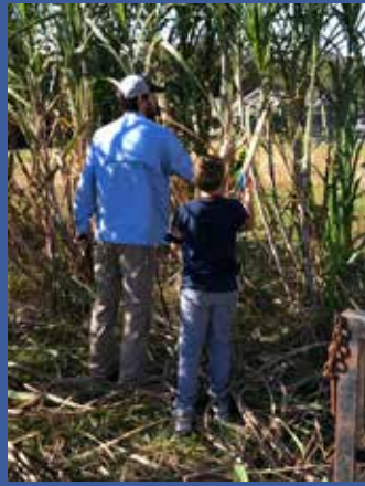
Sugar cane is grown as part of the garden

During the boiling process, the syrup is constantly stirred and additional impurities are removed. Then the finished product is bottled and ready for the breakfast table. The children really love the cane syrup on their pancakes and waffles in the morning. And they are very proud knowing that they made the syrup themselves.