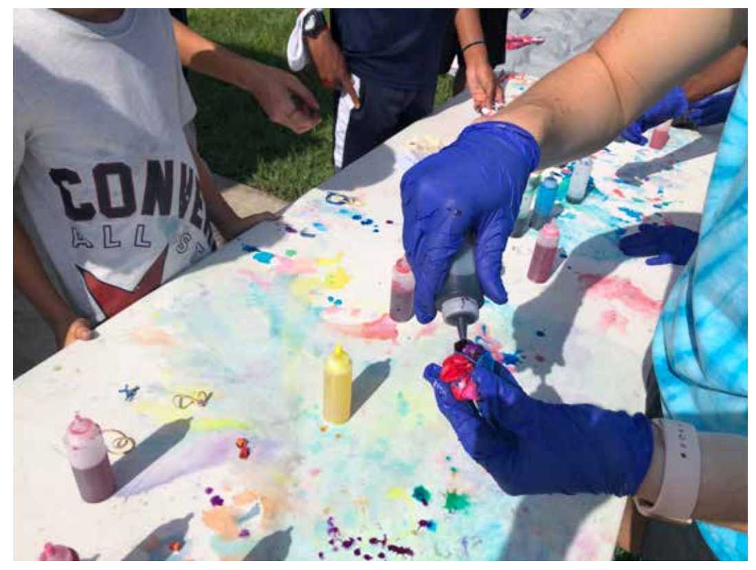
Making tie dye shirts during Camp Rona