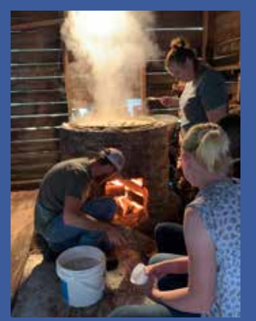
Of course, you need a good fire