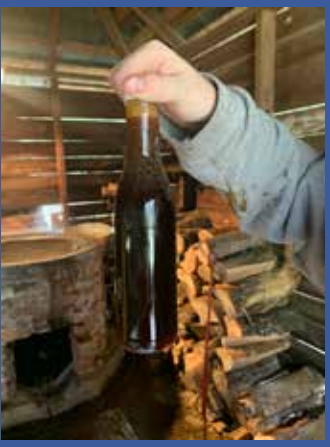
Bottled and ready for the breakfast table