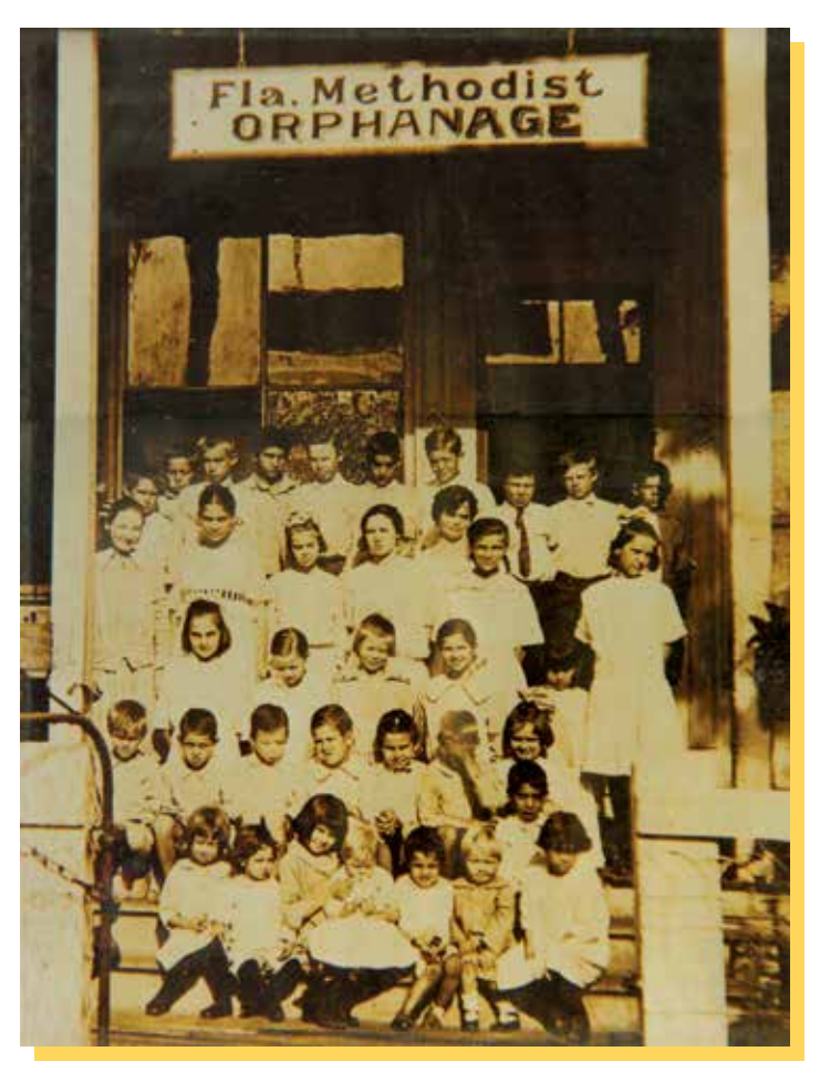
Children's Home, c. 1915

When a youth turns 18, they age out of the group home or foster care system and are deemed adults. However, most of these youth are not prepared to be completely independent. Located on the Enterprise campus, our Independent Living program assists young adults 18-26 as they transition to adult life. This program provides them with a safe place to live and counseling to help them improve their budgeting and other life skills. While in the program, these young adults are attending college or trade school and are usually employed with a local business. Young adults in this program have transitioned into careers in law enforcement, health care, construction, the military, and many other fields.