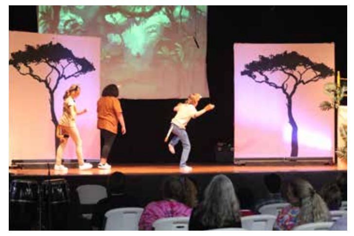
The children's production of The Lion King