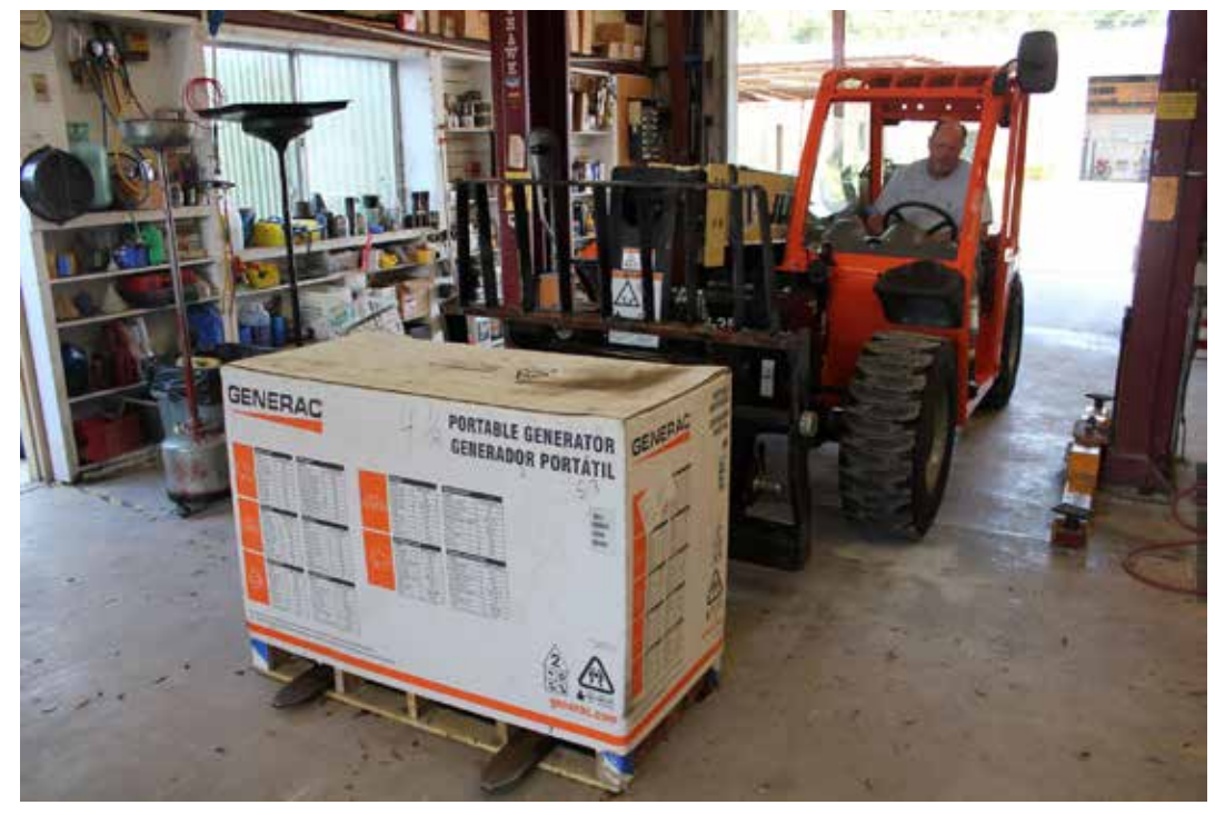
Getting ready for Hurricane Ian