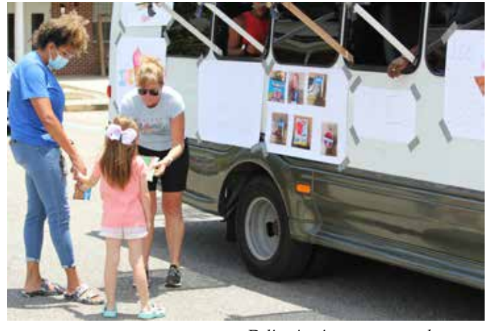
Delivering ice cream around campus