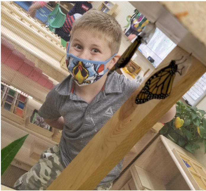
Children learn about the butterfly life cycle at In As Much