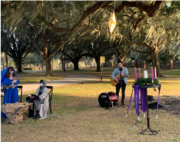
Our Spiritual Life team holding Christmas worship outside