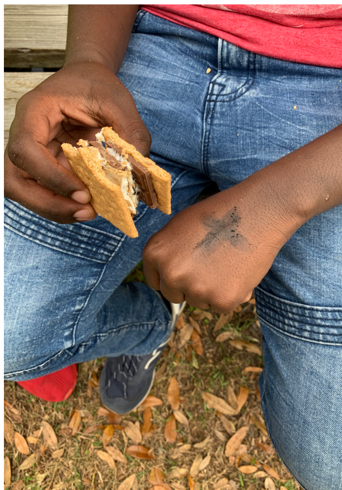
Our youth received ashes, then made s'mores