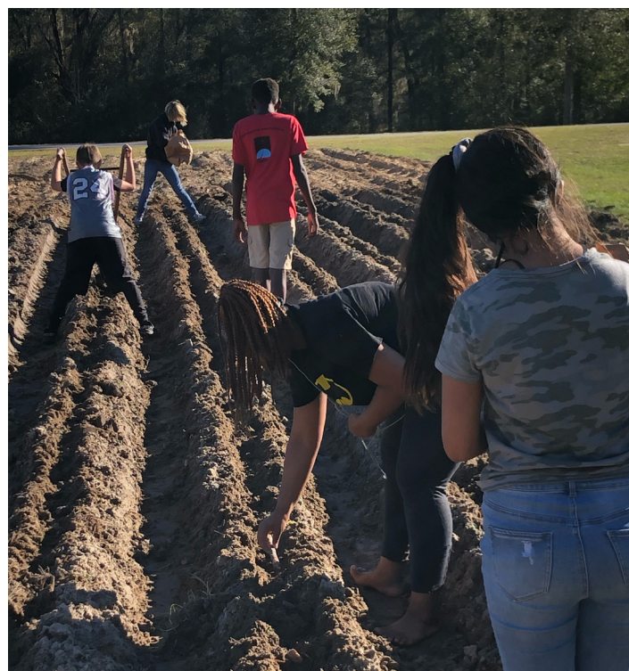
Everyone pitches in to plant the garden at Madison Youth Ranch