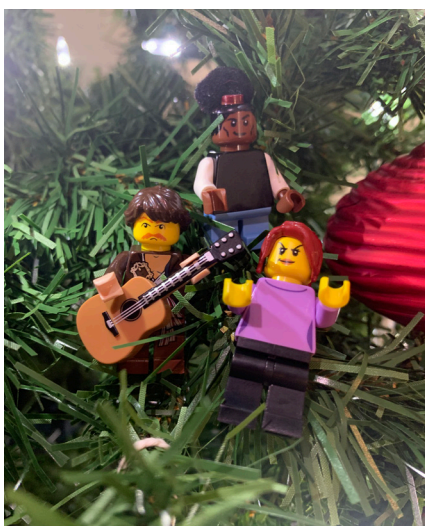
Our Spiritual Life Team in LEGO form.

The past year has been unique for all pastors, churches, and people of faith as we sought new ways to gather, worship, and serve. Many of those new ways of being together have revolved around our individual households. It is a great joy to be part of a household as big as the Florida United Methodist Children's Home. We have many children living together on both campuses and that made our circumstances for gathering together unique.