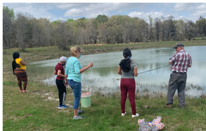
Children from Madison Youth Ranch out for a day of fishing