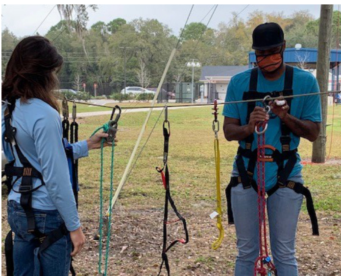
Our Recreation staff renewing their instructor certifications for the ropes course