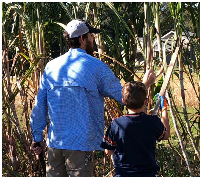
Harvesting sugar cane to create cane syrup