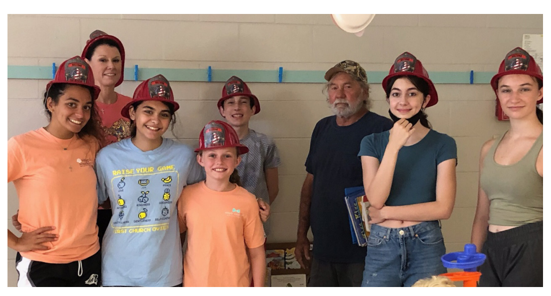
Youth from the Oviedo United Methodist Church volunteer at our Heart & Home Resale Shop