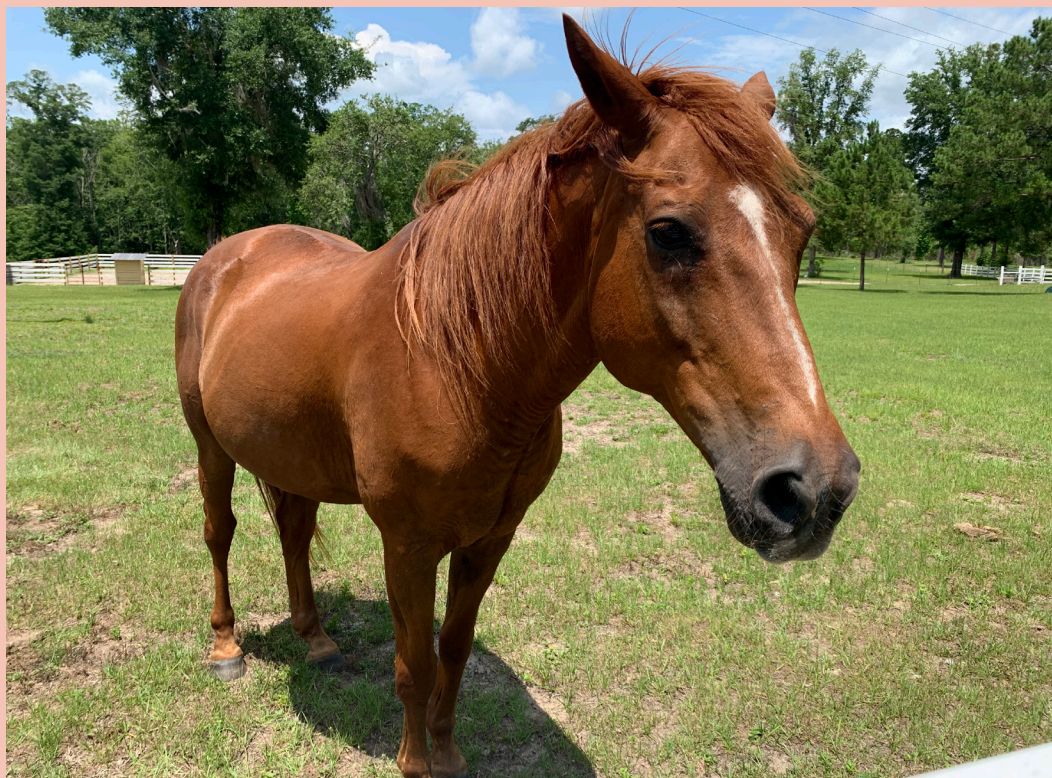
Madison Youth Ranch welcomes their latest addition – Shiloh