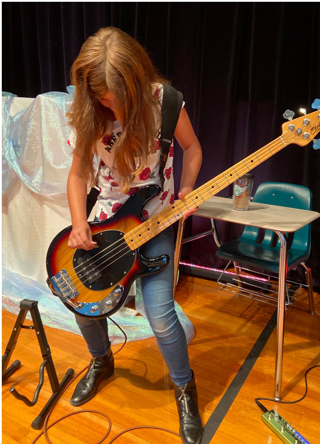
One of our young ladies practicing before a worship service