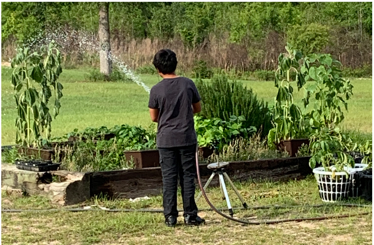
Keeping the garden watered at the Madison Youth Ranch