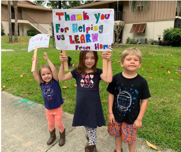
Some of our children greeting teachers on parade during COVID-19