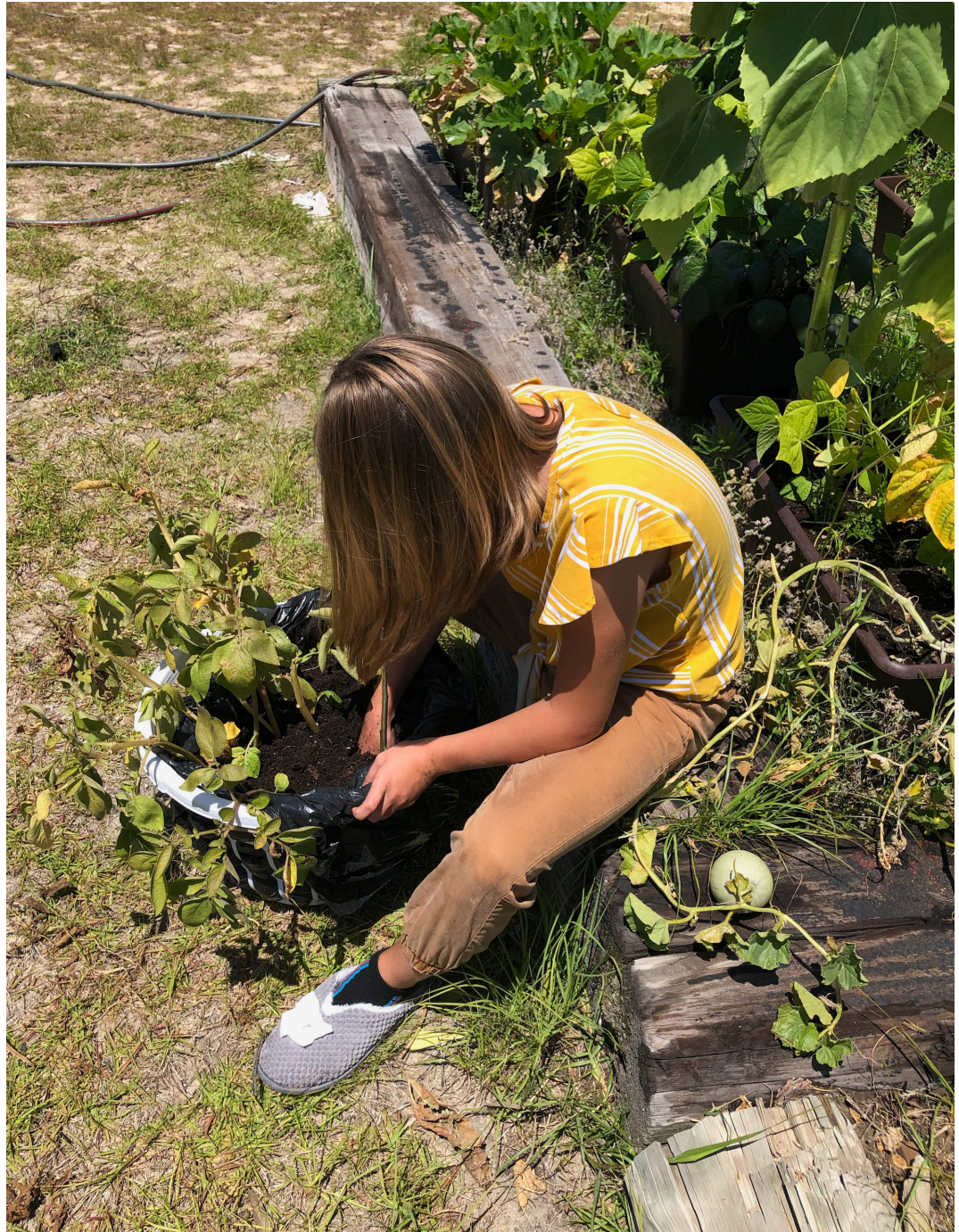
Tending to the garden at Madison Youth Ranch