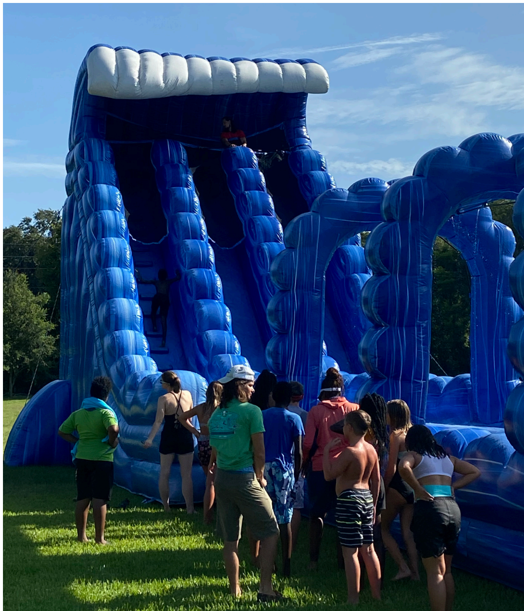
The giant water slide for summer camp