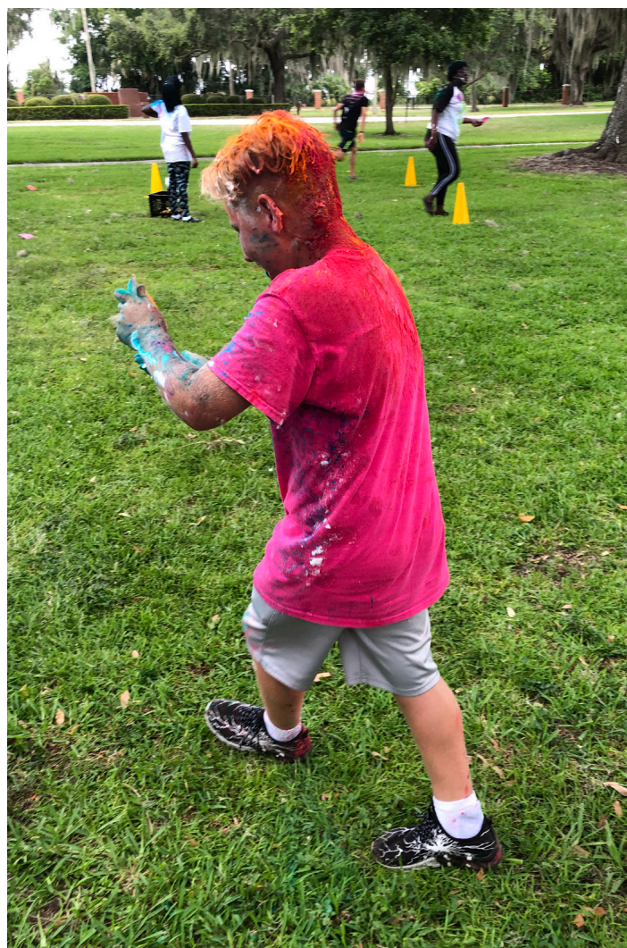
Messy day at summer camp