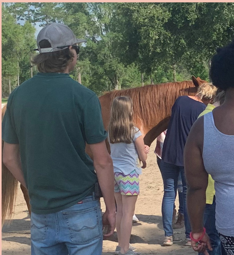
Children take some time to meet Shiloh