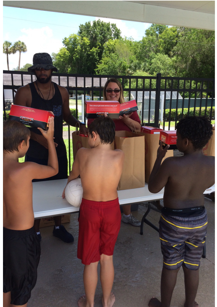
Poolside lunch to celebrate the end of the school year