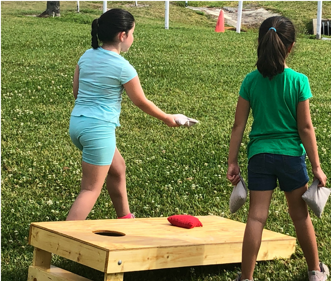
The children enjoying a game of cornhole

TRIBUTES RECEIVED BETWEEN JANUARY 1 AND MARCH 31, 2020