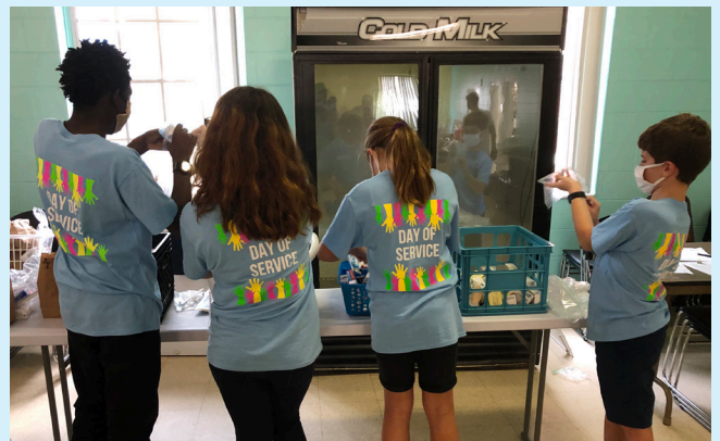
Assembling Halloween treat bags for other children