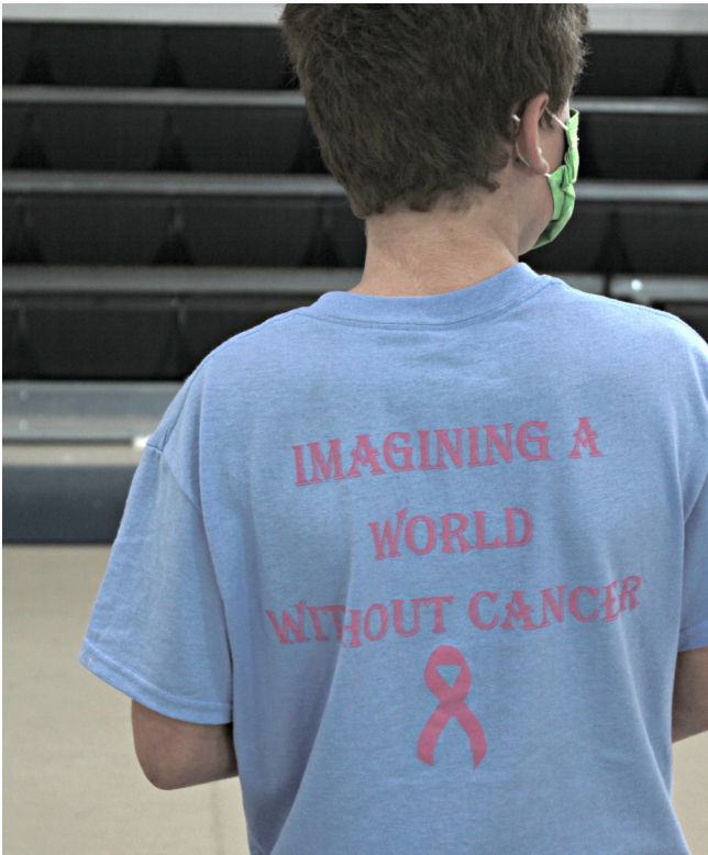
One of our youth sporting a Pink October shirt