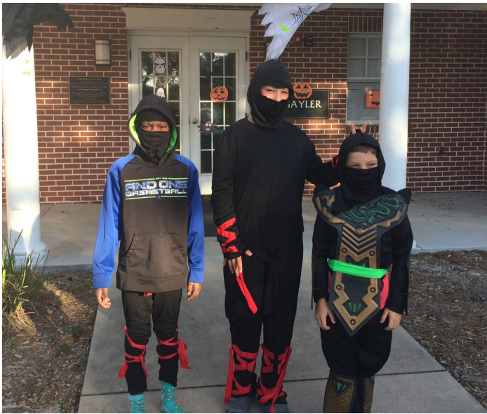
Some of our boys dressed as ninjas for Halloween