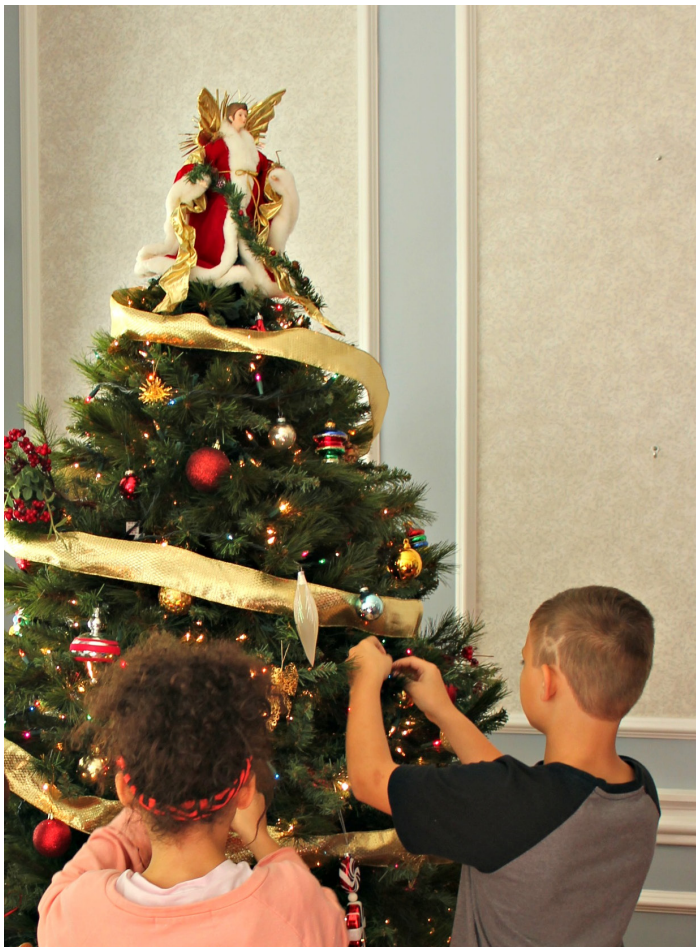
Putting the finishing touches on the tree