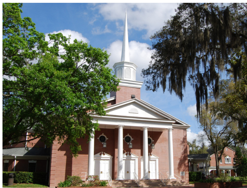
First United Methodist Church of Oviedo