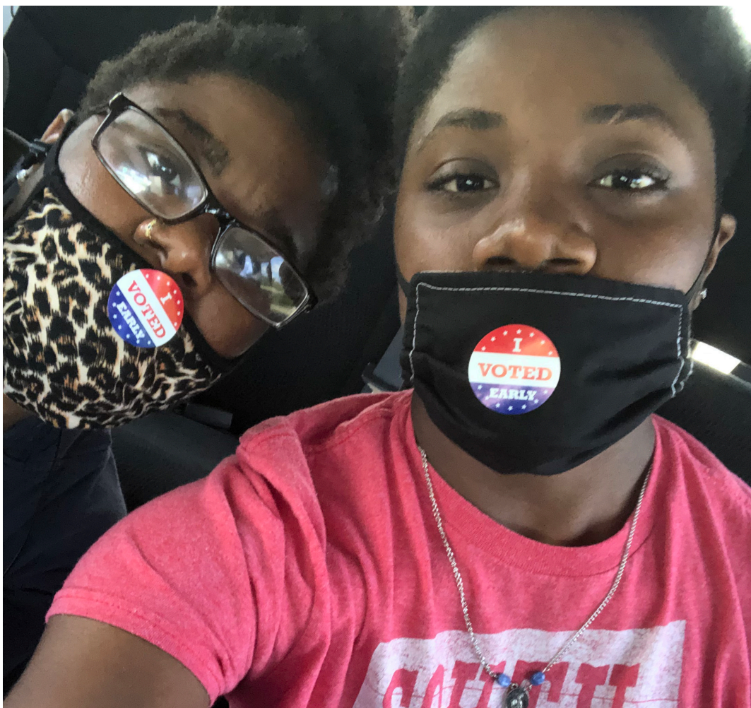
Youth from our Independent Living program voting for the first time