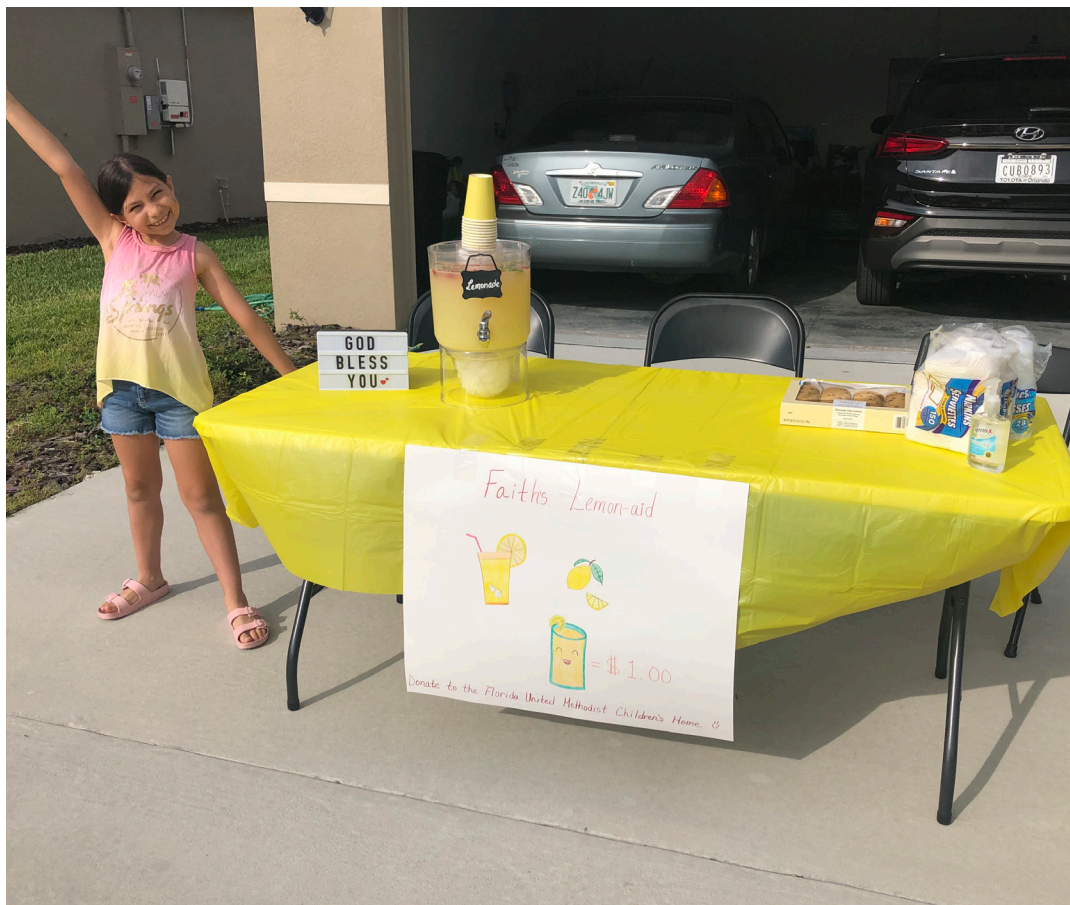
Faith selling lemonade to benefit our children

TRIBUTES RECEIVED BETWEEN JULY 1 AND SEPTEMBER 30, 2020