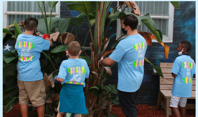
Teamwork makes tree trimming easy