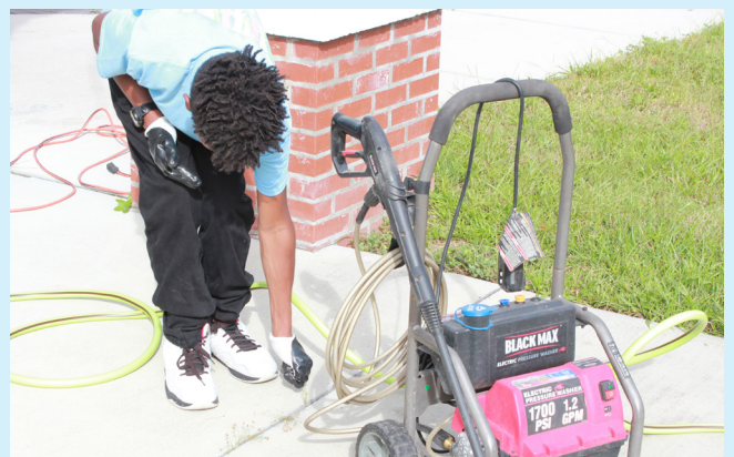
Removing the weeds in the crack before pressure washing