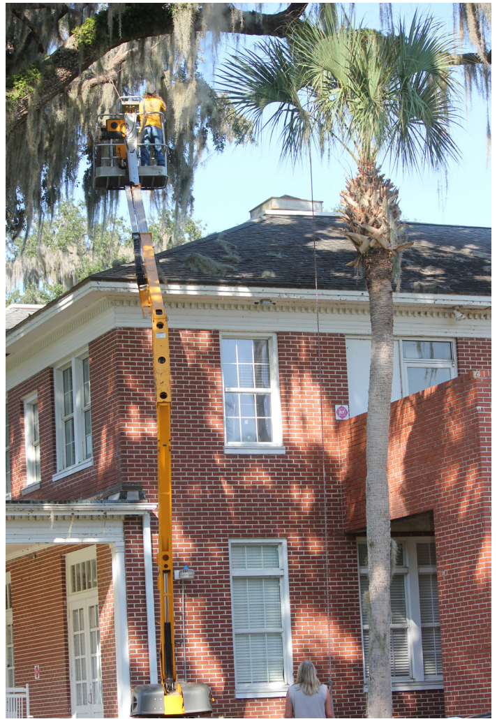
Trimming the large oaks on campus requires skill and special equipment