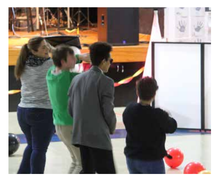
Homecoming dance action