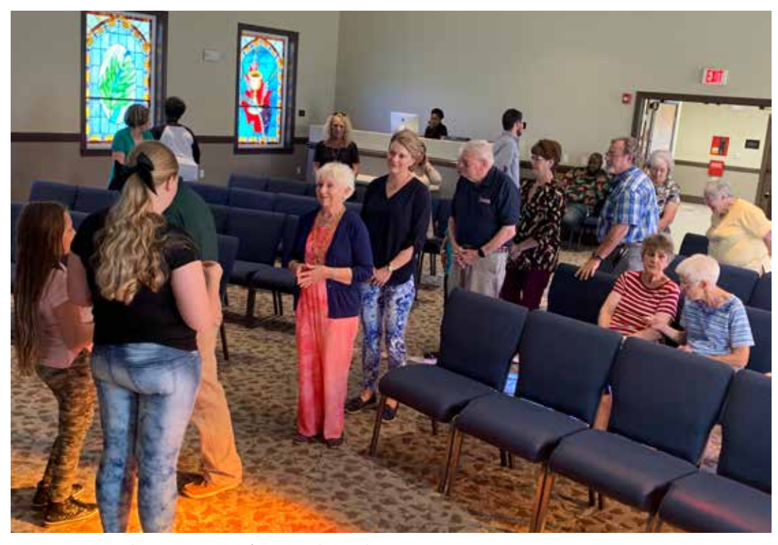
Community worship service at Madison Youth Ranch