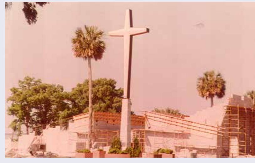
The chapel under construction in 1978

Another generous gift was provided by Bernie Simpkins, making it possible to update and upgrade the music suite. The renovation allowed us to make the music suite larger and more functional, while also updating the recording studio which is used in the production of videos and music programs. This gives the children an opportunity to learn about digital editing and recording through hands-on experience.