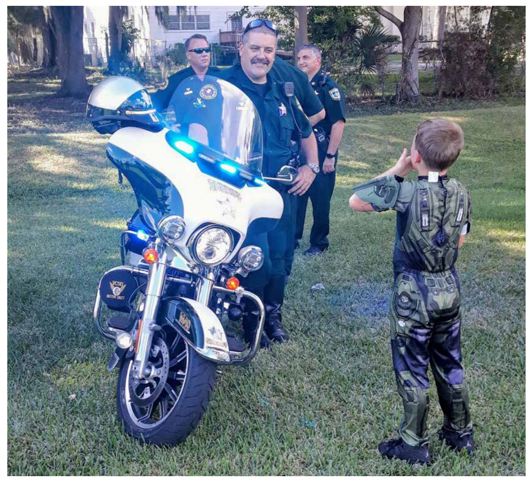
Volusia County Sheriff's Office showing off their lights