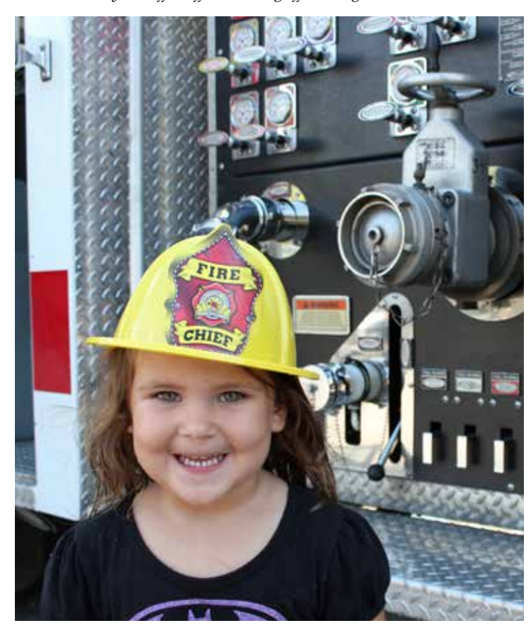
Safety Week at In As Much Montessori