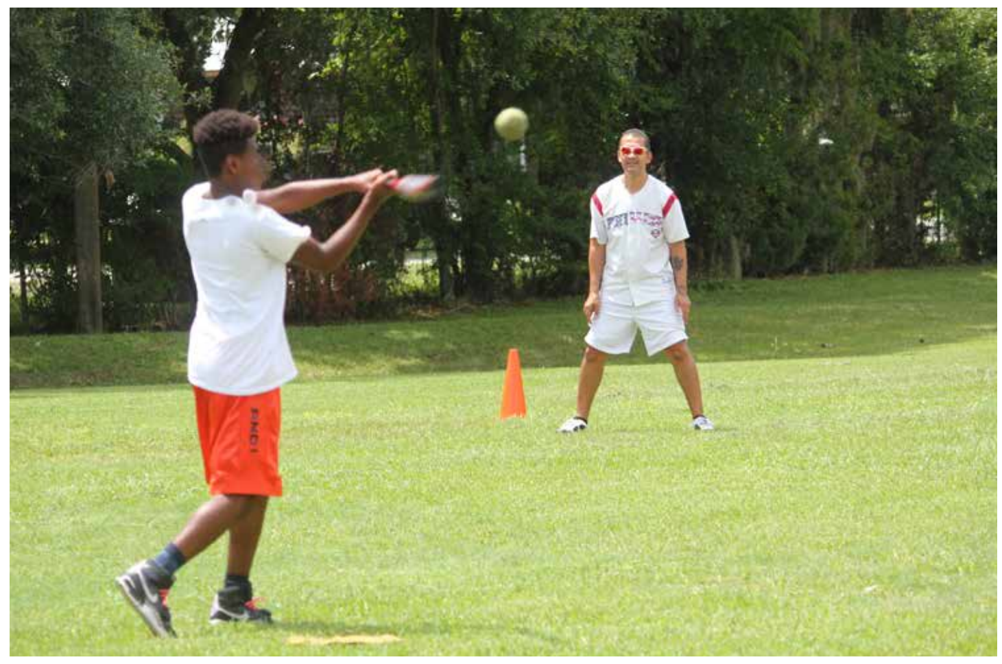
Social Skills improve with TFM

Through the support of her house parents, therapist and other staff, and their application of the TFM, she has greatly improved. She has become much more outgoing and sociable of the past few months, and now looks for opportunities to help