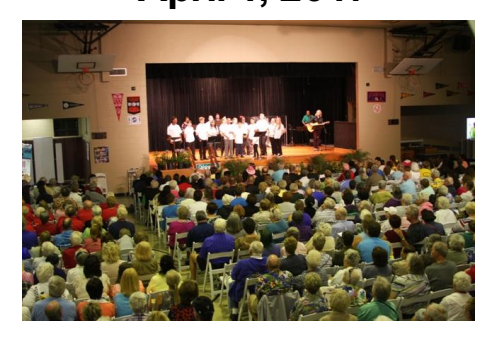
Specially Invited Districts: Gulf Central South Central