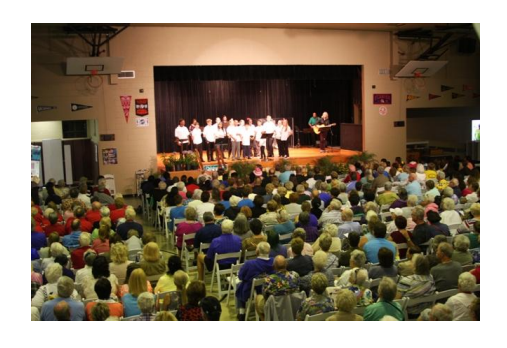
Specially Invited Districts: Gulf Central South Central

Neither the author, nor this organization is engaged in rendering legal or tax advice. For advice and assistance in specific cases, the services of an attorney or qualified financial advisor should be obtained.