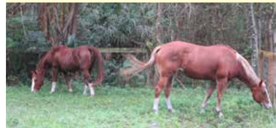
Pinky and Sugar join the staff at Madison Youth Ranch.

Madison Youth Ranch has launched its Equine Assisted Therapy program with the addition of Pinky and Sugar to their staff. Studies have shown the benefits of this type of therapy, particularly for children suffering emotional or behavioral issues that stem from previous abuse. Because the horses often perceive and mirror human emotion, they will help the therapist to identify underlying issues in the child and build a bond with the horse. Pinky and Sugar are residing in the Stickney Stable, completed this past summer.