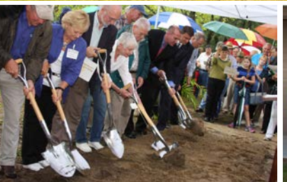
Madison Youth Ranch Groundbreaking Sept. 18, 2012