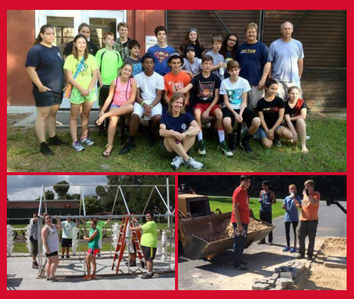
Top: Mission work team from First UMC of Coral Gables; Bottom left: Youth from Arlington UMC in Jacksonville constructing a greenhouse on the Enterprise campus; Bottom Right: Southside UMC of Jacksonville youth working at the Madison Youth Ranch

This year, groups of youth and adults have come, or are scheduled to arrive, from the churches and organizations listed below. They represent over 200 volunteers and thousands of hours of volunteer service.