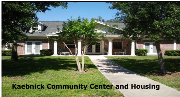
Kaebnick Community Center and Housing

Providing supportive and structured residential care, case management services, and life skills training for young adults exiting foster care and other young adults and single mothers