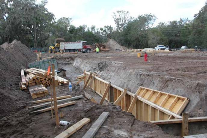
Preparing the footers for the Lamar Louise Curry Early Childhood Education Development Center.