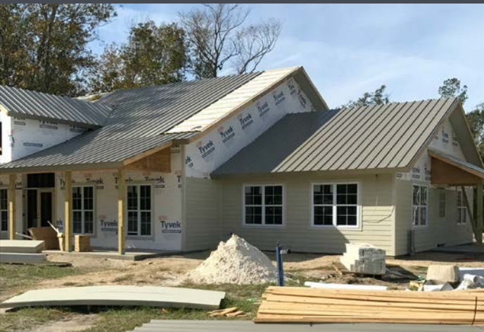
The new Counseling & Support Services Center at the Ranch.