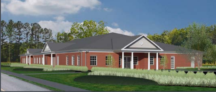
The Lamar Louise Curry Early Childhood Education Development Center should open in late 2018.