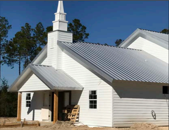
The new Chapel at the Ranch.