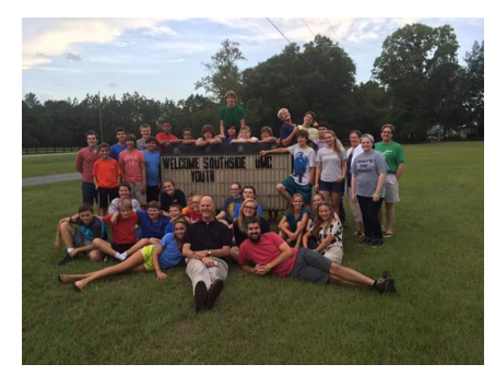
Southside UMC, Jacksonville