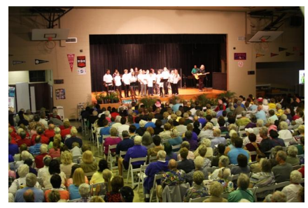
Specially Invited Districts: Gulf Central South Central