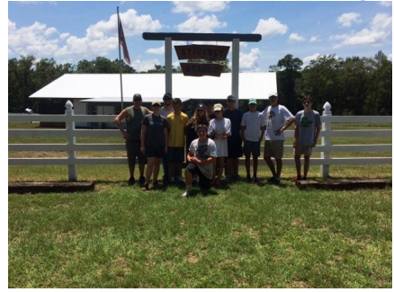
Riverside Park UMC, Jacksonville