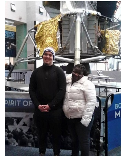
Left, one of our residents presents our Congressman, John Mica, with a gift from the Children's Home. Right, a visit to the National Air and Space Museum. Pictured below is a visit to the Arlington National Cemetery.

Six of our residents who are students at our on campus school, Legacy Scholars Academy, were able to take advantage of a tremendous opportunity to experience Washington, D.C. They were able to meet and talk with our congressman and experience our government at work. They also visited museums and other cultural opportunities available in our nation's capital. This trip was certainly the highlight of their school year.