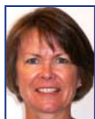
Beverly Hollis First UMC, Lakeland