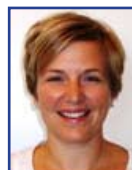
Heather Pancoast Community UMC, Fruitland Park